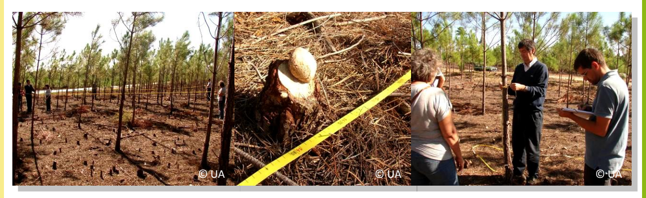
Establishment of the monitoring plot (15/10/2009)