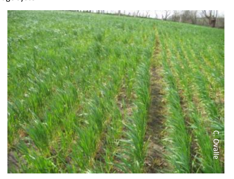
Wheat grown with no-tillage gives higher yields than with traditional tillage

Also, in April 2010 we began to publish the first of three articles in the local Chilean newspaper: "Diario la Discusión", all about the conservation techniques used in the DESIRE Project.