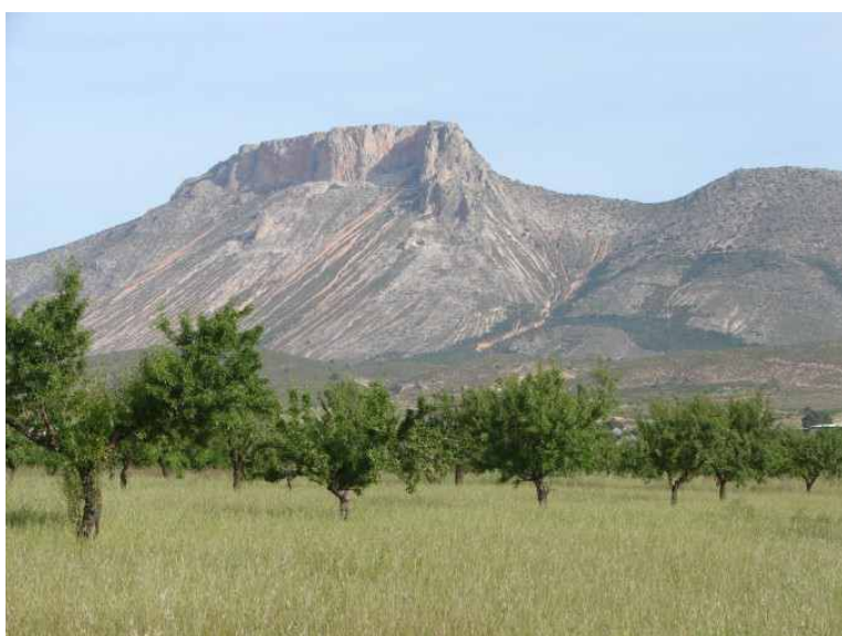
Almond field with green manure in the central part of the Guadalentín basin, SE Spain (May 2007)

Here soil erosion and water shortage are common, particularly associated with tillage or land abandonment. The soil is very susceptible to erosion, so that in this semi-arid climate high intensity rain storms easily cause rills and gullies to form. Stakeholders have agreed that measures to increase infiltration and soil water content, such as minimum tillage, mulching and water harvesting structures should be tried. Runoff and erosion may be reduced by using terraces and vegetation strips or mulching. The landscape should be assessed and planned to provide a mosaic of integrated uses and there should be a shift to high quality certified products for example from ecological agriculture. Locally, the nutrient content of the soil may be increased by liquid manure from local pig farms.