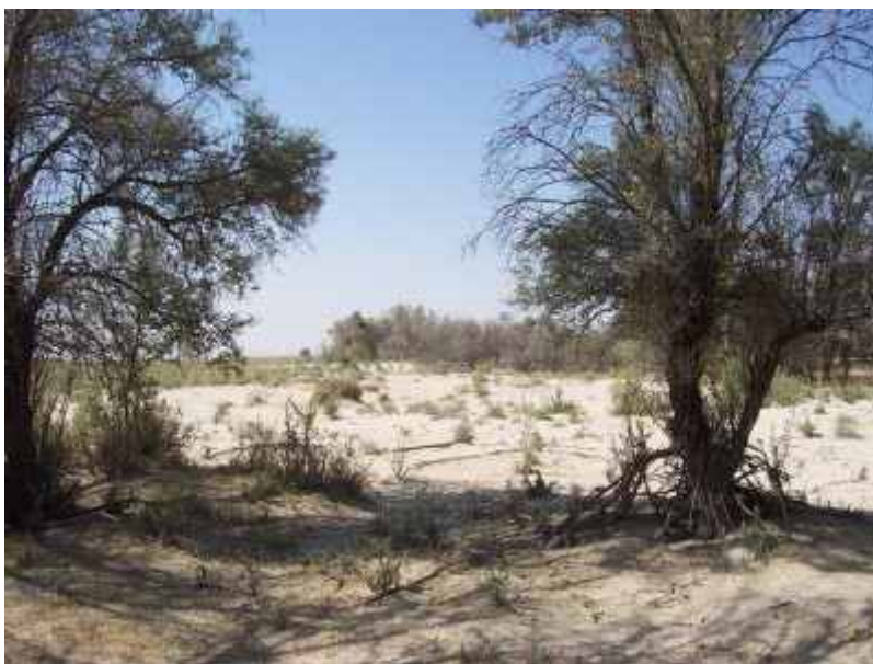
Tree colonisation of sand dunes, Karapinar, Turkey.

Wind erosion is the major problem here, on the sediments remaining from an ancient shallow lake. The main crops are cereals and sugar beet. Various soil protection and irrigation strategies have been tried in the past, some successfully and some not. Strategies will be reviewed and suggested improvements, including rotational grazing, strip cropping and drip irrigation, will be tested.