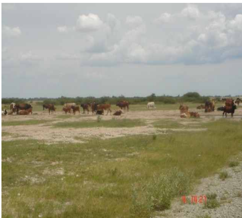
Grazing in the Boteti region, Botswana (February 2008)

Subsistence agro-pastoralism persists in the area against the backdrop of a semi-arid climate. The droughts in Boteti are endemic, with an estimated recurrence interval of 10-18 years, and the area is recognized as a hotspot of land degradation driven by overgrazing and dry season wind erosion. In order to safeguard land-based livelihoods, since 2002 joint efforts by the Government and the United Nations Environment Programme have been promoting community-based conservation of the land and indigenous vegetation. Mitigation strategies contributing to livelihood diversification and poverty alleviation will include water harvesting, harnessing of solar power, game ranching and biogas production and utilization. The communities have picked biogas production for piloting because of its potential to conserve vegetation and to promote small-scale bakery businesses.