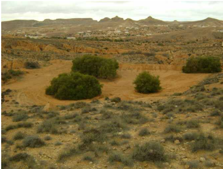
Rangelands in Zeuss Koutine, Tunisia (January 2009)