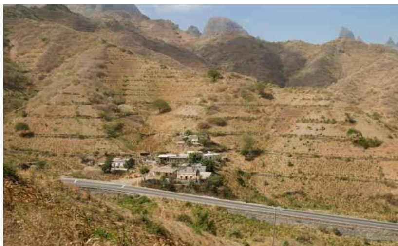
Terraces for maize, supporting peas and beans, Santiago Island, Cape Verde (January 2008)

With less than 300mm annual rainfall and about 23 000 ha of arable land with steep slopes, the natural resources of the largest agricultural island - Santiago, (off the west coast of Africa), have to be used judiciously. Investment in soil and water conservation has been essential to support food production for the more than half of the country's population. The arid hillsides are terraced wherever possible, to grow maize and different beans (and peas), supported on the maize stalks, as staple foods for the islanders. In 2000, 30% of the country's population was below the poverty line so effective water use is under constant scrutiny.