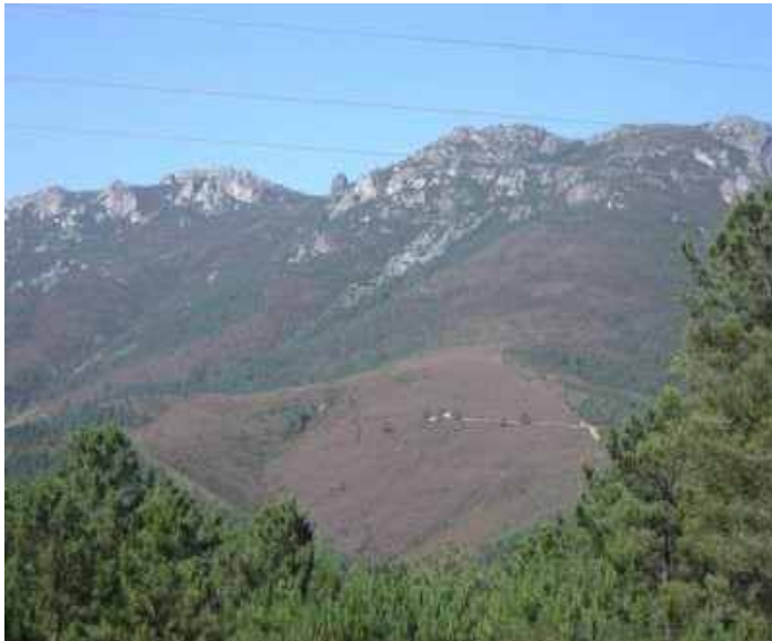
The Vale Torto catchment, Góis , Portugal, (in the foreground) is being instrumented to record soil loss before and after controlled fires.