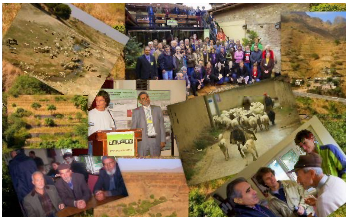
DESIRE scientists talk to local people about desertification problems

The desertification issues in this DESIRE study site can be summarised as follows: