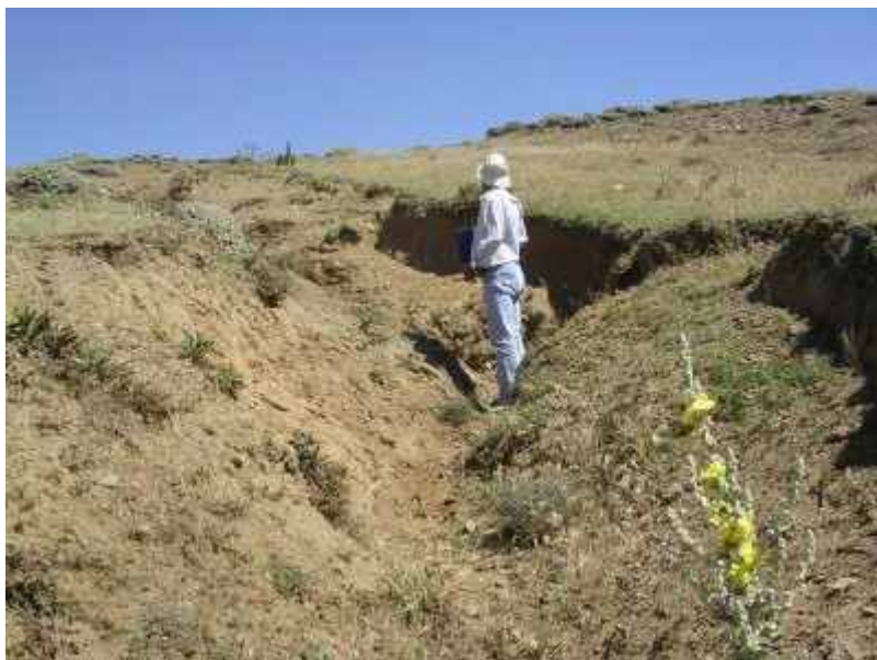
Extensive gully erosion in heavily-grazed pastures, Keskin village, Eskisehir, Turkey.

There are many challenges in the Eskisehir region. The growing city of Eskisehir is attracting new economic investment and agriculture is also expanding to support the needs of the population. Erosion by water, erosion by wind, salinisation and the effects of rapid urbanization are all seen in association with land degradation, in an area with sparse natural vegetation and a trend of climate change towards increasing aridity. Strategies for sustainable development need to find a balance among competing pressures. Crop rotation, mulching and tree planting may be used to improve soil fertility, drip irrigation will limit water loss, and terraces and check dams may reduce soil erosion and water loss.