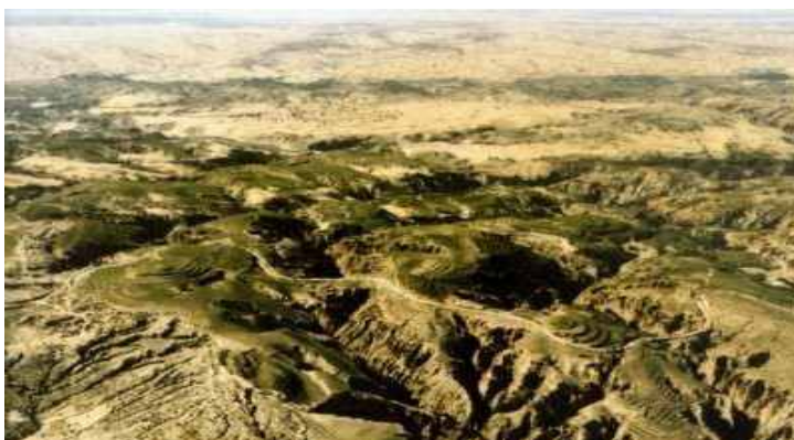
Erosion patterns on the loess plateau, China

Soil erosion on the loess sediments is the prevailing desertification problem, and every year about 0.01 to 2 cm topsoil is washed away. New ways to prevent soil erosion and improve soil stability and fertility will be investigated.