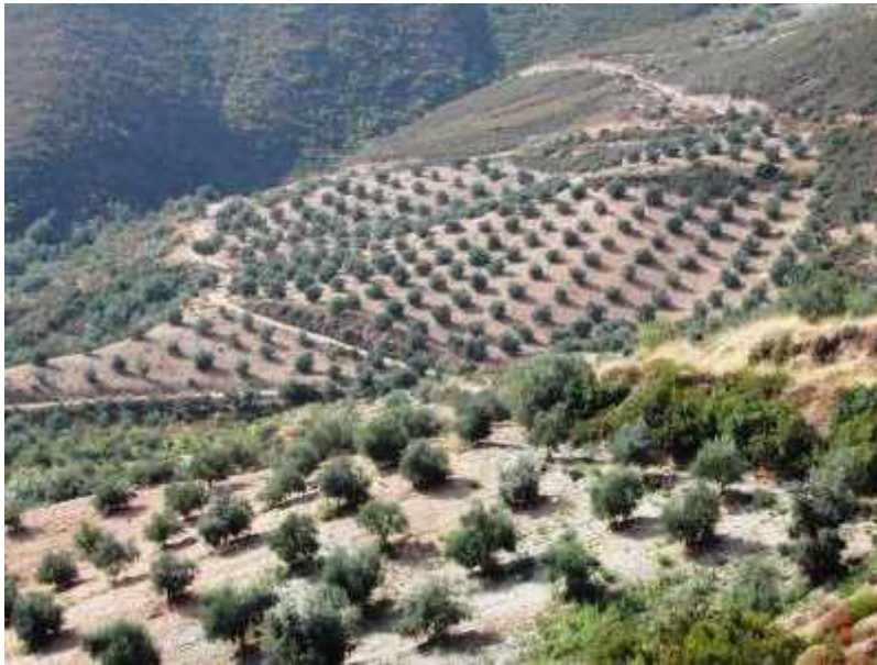
Olive plantation, Chania, Crete.